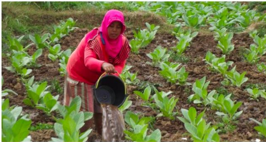
Petani tembakau.

Association: Alternative Tobacco (OTPs) Regulation is necessary to prevent use by children